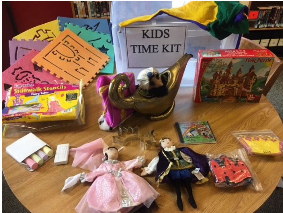
Castles and Fairy Tales Southwest Wisconsin Library System 1300 Industrial Drive, Suite 2, Fennimore WI 53809